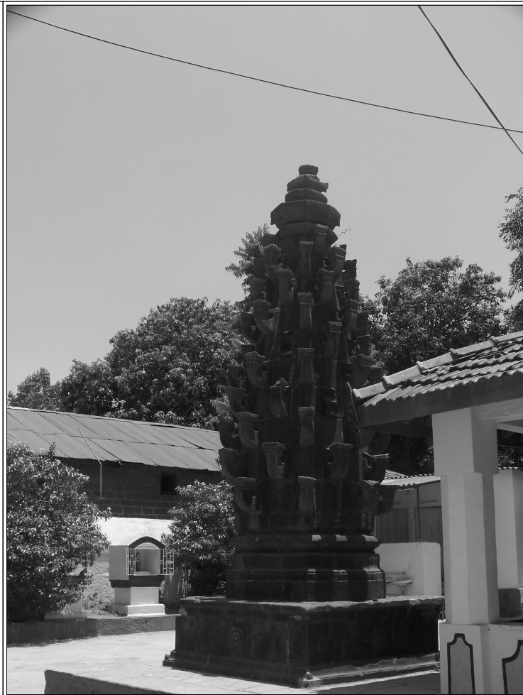
Image Title: Vitthal Mandir Sansthan2 Image Type: Front-View Reference: Deepmala inside the temple