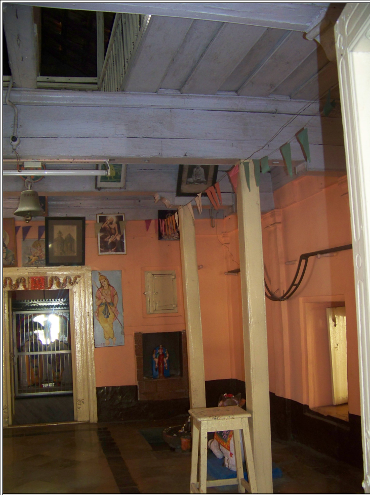
Image Title: Vitthal Mandir Sansthan2 Image Type: Top-View Reference: Interior of the temple mandap