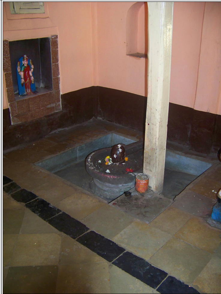
Image Title: Vitthal Mandir Sansthan2 Image Type: Front-View Reference: One of the deities inside the temple