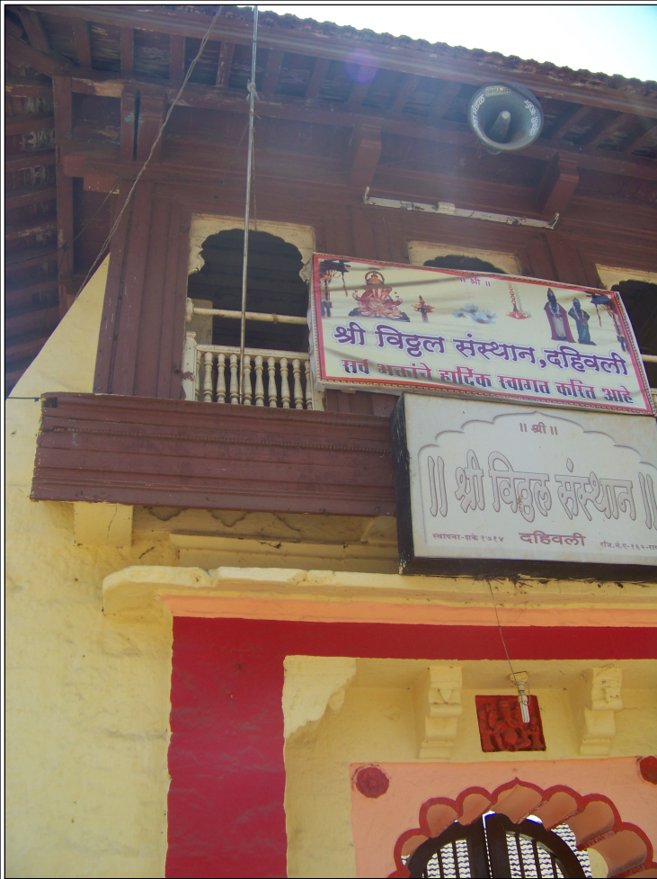
Image Title: Vitthal Mandir Sansthan2 Image Type: Front-View Reference: The front facade of the gate house building