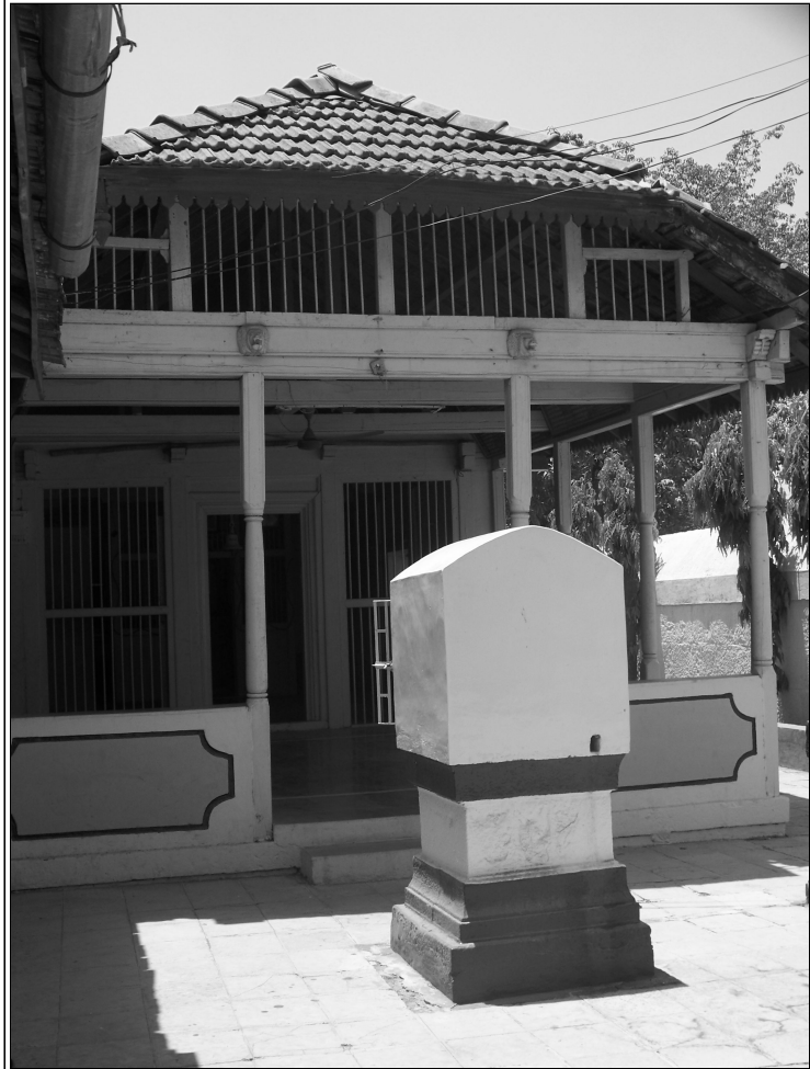
Image Title: Vitthal Mandir Sansthan Image Type: Front-View Reference: Garudmandap in front of the vitthal mandir