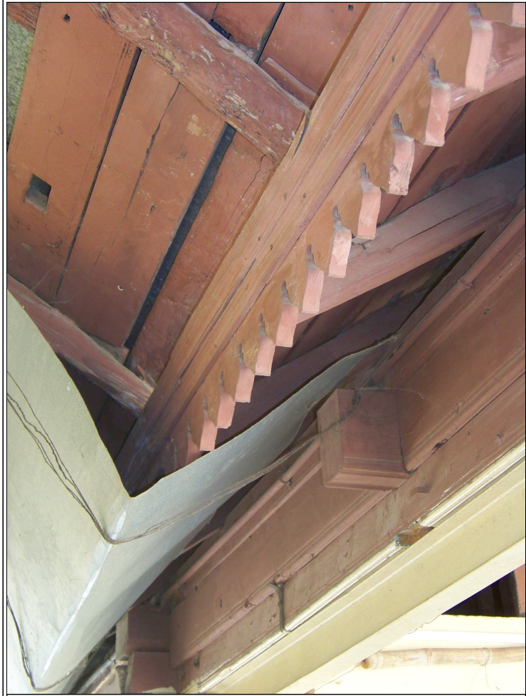
Image Title: Vitthal Mandir Sansthan2 Image Type: Top-View Reference: Detail of the eveboard and valley