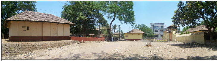
Image Title: Vitthal Mandir Sansthan Image Type: Front-View Reference: General view of the area around the temple with other shrines and large old trees