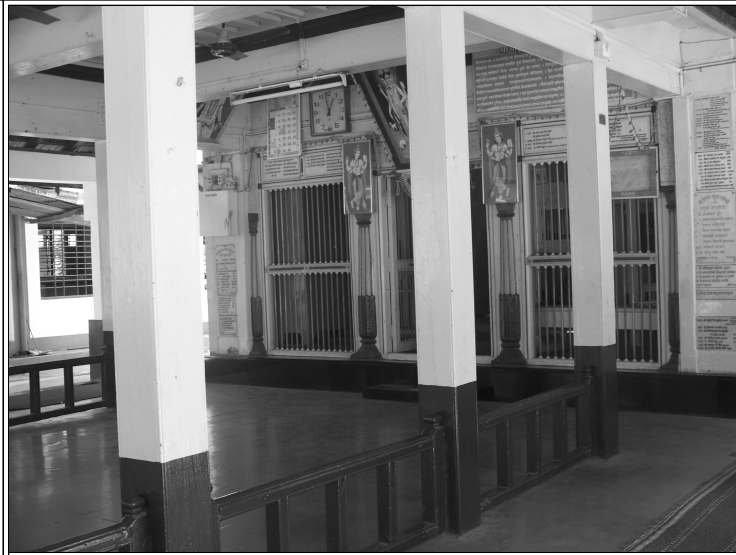
Image Title: Vitthal Mandir Sansthan2 Image Type: Front-View Reference: General view of the mandap