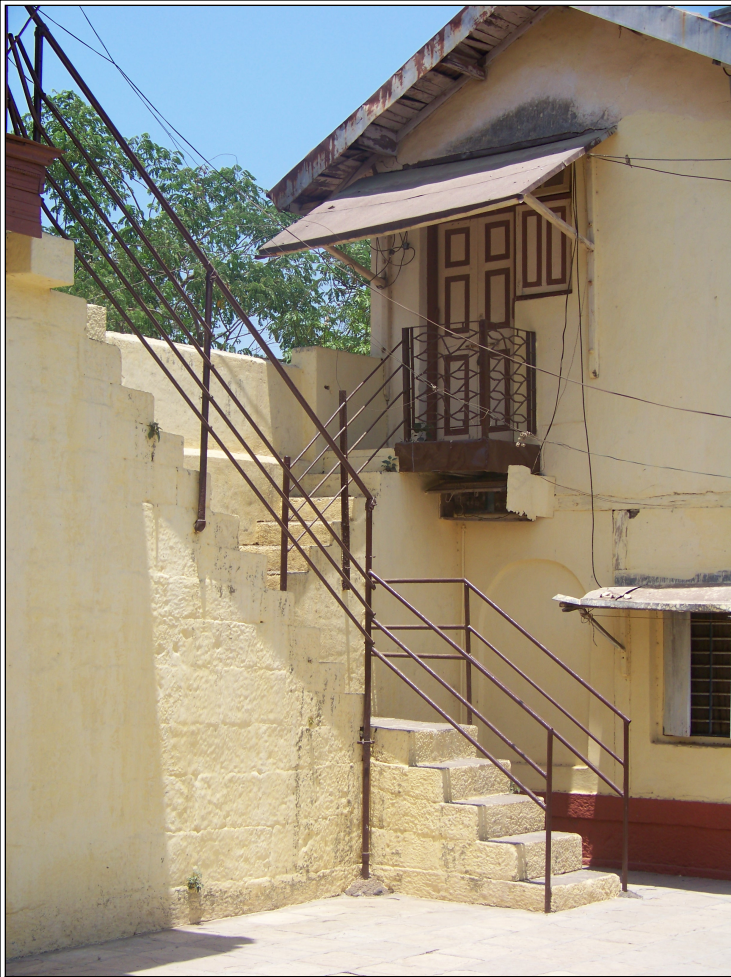
Image Title: Vitthal Mandir Sansthanandir Sansthan2 Image Type: Front-View Reference: Steps leading to the nagarkhana with the new railing