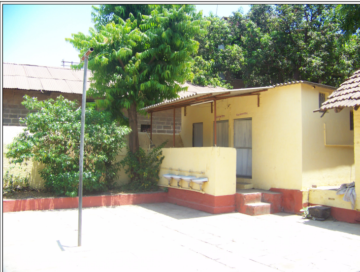
Image Title: Vitthal Mandir Sansthan2 Image Type: Front-View Reference: View of the temple from the inner court