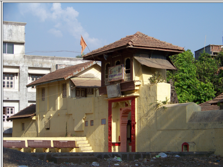
Image Title: Vitthal Mandir Sansthan2 Image Type: Front-View Reference: General Street view of the temple