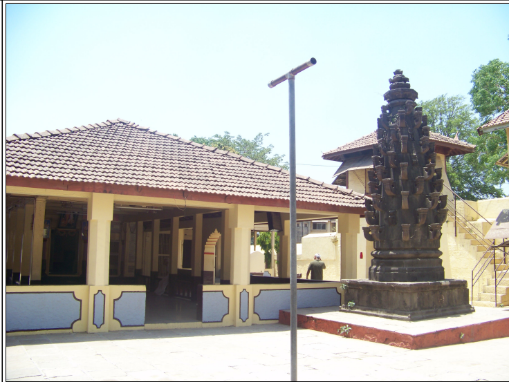
Image Title: Vitthal Mandir Sansthan2 Image Type: Front-View Reference: Deepmala inside the temple