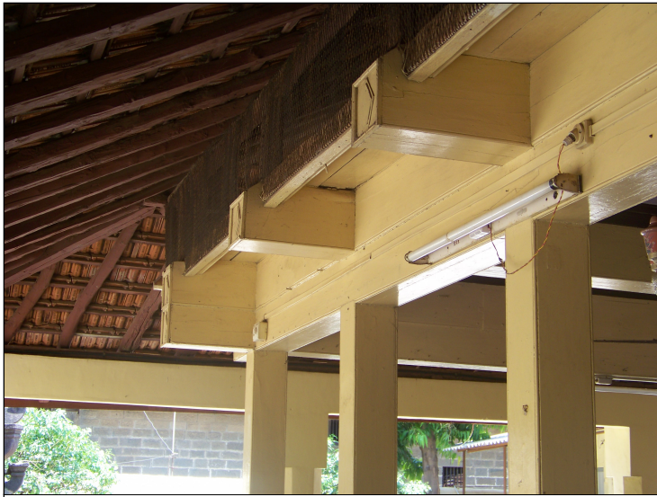
Image Title: Vitthal Mandir Sansthan2 Image Type: Top-View Reference: Detail of timber work of the temple