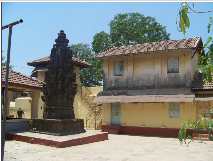
Image Title: Vitthal Mandir Sansthan3 Image Type: Side-View1 Reference: Deepmala inside the temple