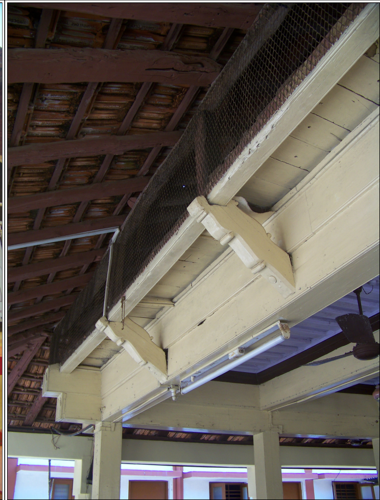
Image Title: Vitthal Mandir Sansthan2 Image Type: Top-View Reference: Close up of timber work