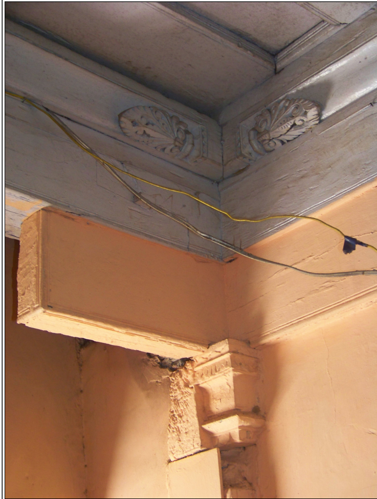
Image Title: Vitthal Mandir Sansthan2 Image Type: Top-View Reference: Detail of timber support system