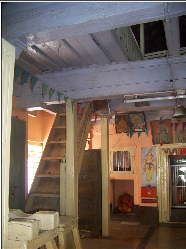
Image Title: Vitthal Mandir Sansthan Image Type: Top-View Reference: Interior of the temple showing the stairs leading to the first floor