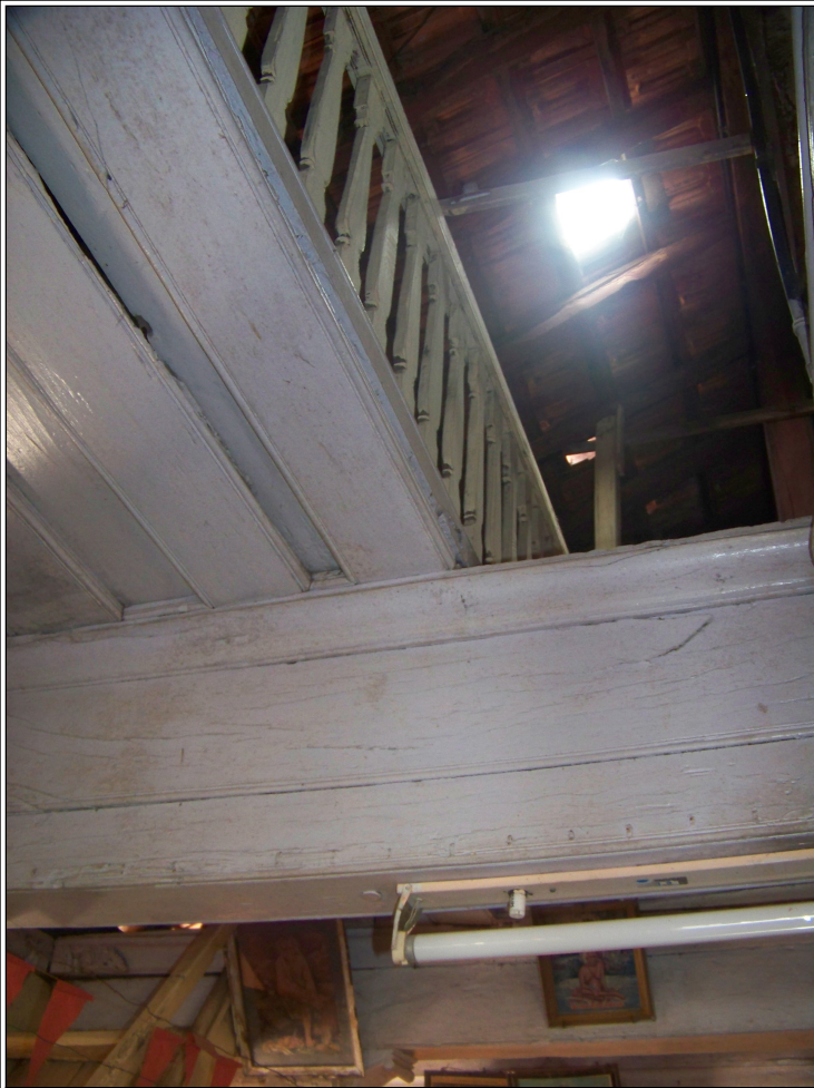
Image Title: Vitthal Mandir Sansthan2 Image Type: Front-View Reference: Overlooking balcony inside the temple