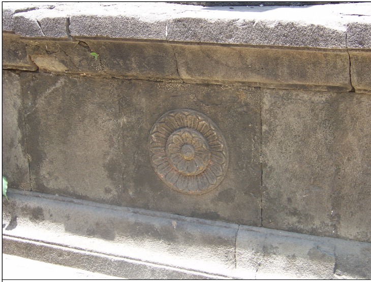
Image Title: Vitthal Mandir Sansthan2 Image Type: Front-View Reference: Motif carved in store