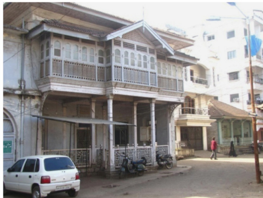
Mustafa Manzil, Bhiwandi