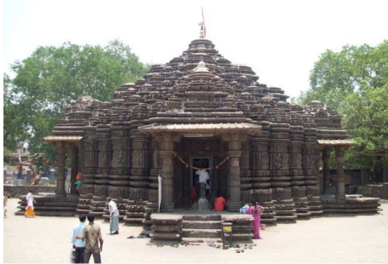
Shiv Mandir, Ambernath