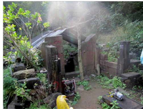
Shiv Mandir, Dindigad