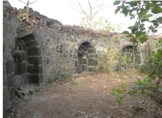
Belapur Fort, Navi Mumbai