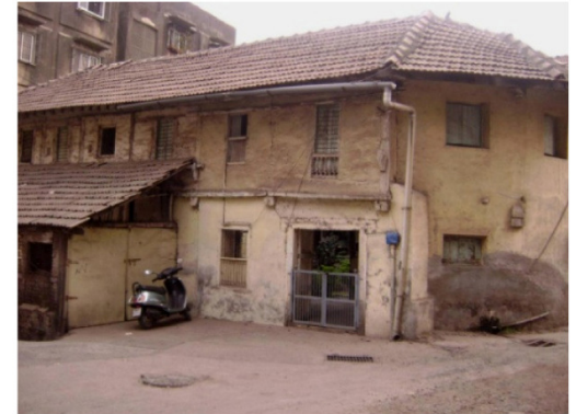
Karve Wada, Bhiwandi